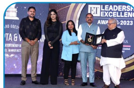
Excellence In Solar Panel Manufacturing By ET Leadership Excellence Award - 2023