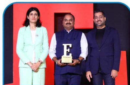
Green Entrepreneur of the Year - 2023 By Entrepreneur India