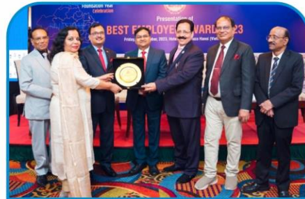
Best Employer By Employers Association of Rajasthan - 2023

INA Solar has created a benchmark and established a goodwill that resonates with the essence of our solar industry. INA Solar has won over 40 international and national awards for its amazing contribution to the solar energy sector.