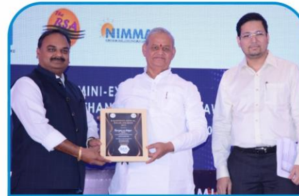
Solar Module Manufacturing Company of The Year Utility Scale Domestic Manufacturer Award By EQ International