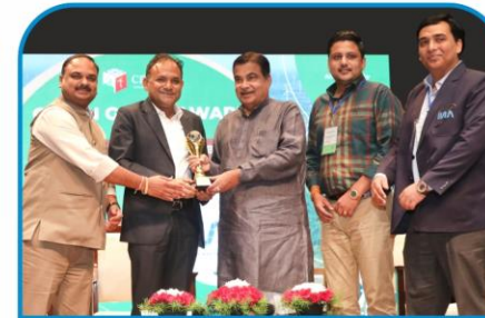
Green Globe Awards 2023 awarded for Excellence in Renewable Energy - Solar By CRESPIA at IIT, Delhi