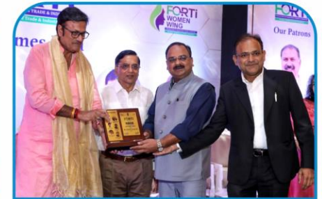
MSME Award By Forti - 2023