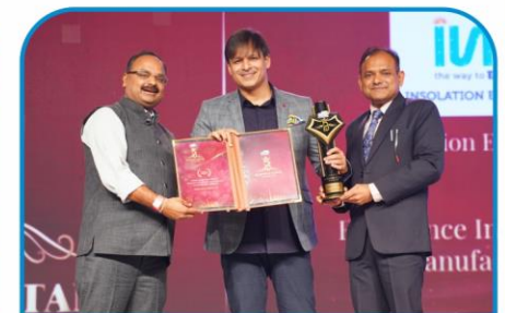
Excellence In Solar Panel Manufacturing By Radio City Business Titans Award, Dubai - 2022