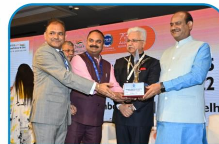
Distinguished Entrepreneur Award In MSME Category By PHDCCI - 2022